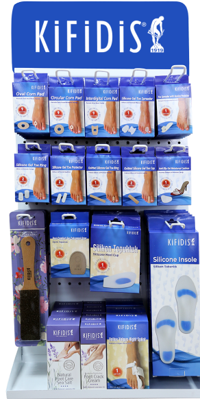
Small Display Stand