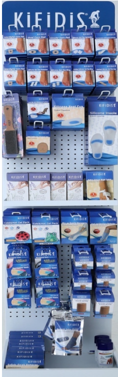
Large Display Stand